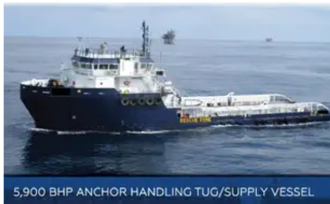
5,900 BHP ANCHOR HANDLING TUG/SUPPLY VESSEL